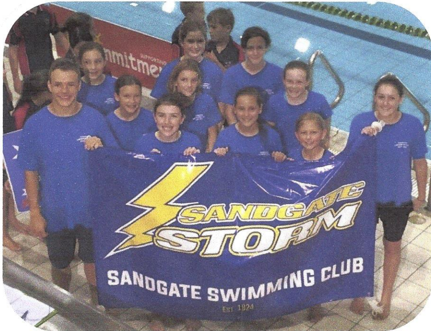
The Sandgate Relay team during them march past at the 2016 Brisbane Relay Championships at Chandler

Full results from all meets can be found on the website http://sandswim.com.au/?Swim Meet Info and Results